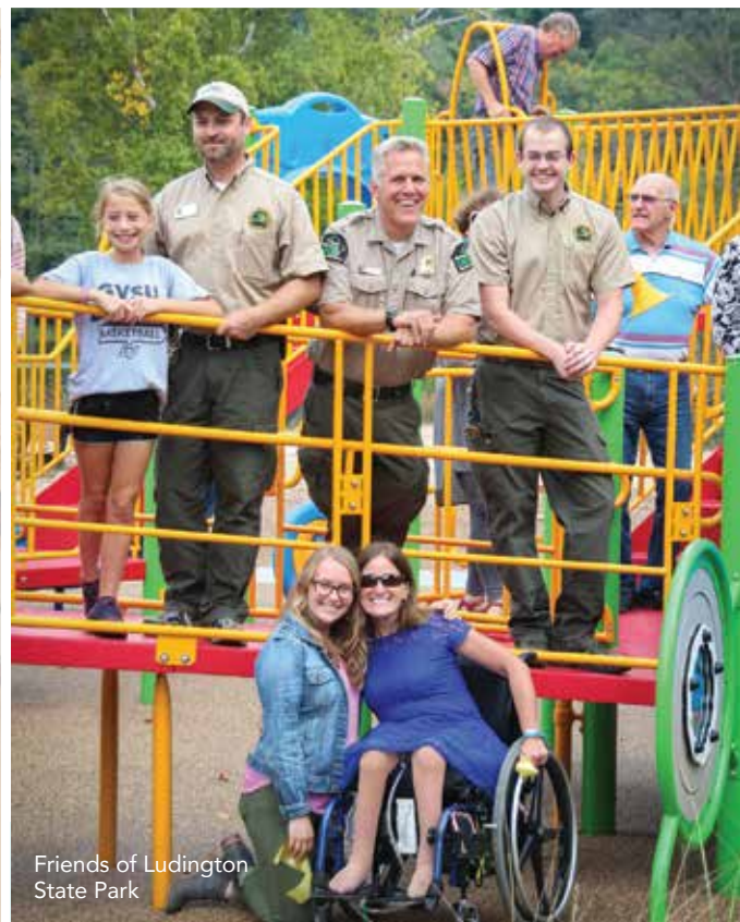
Friends of Ludington State Park