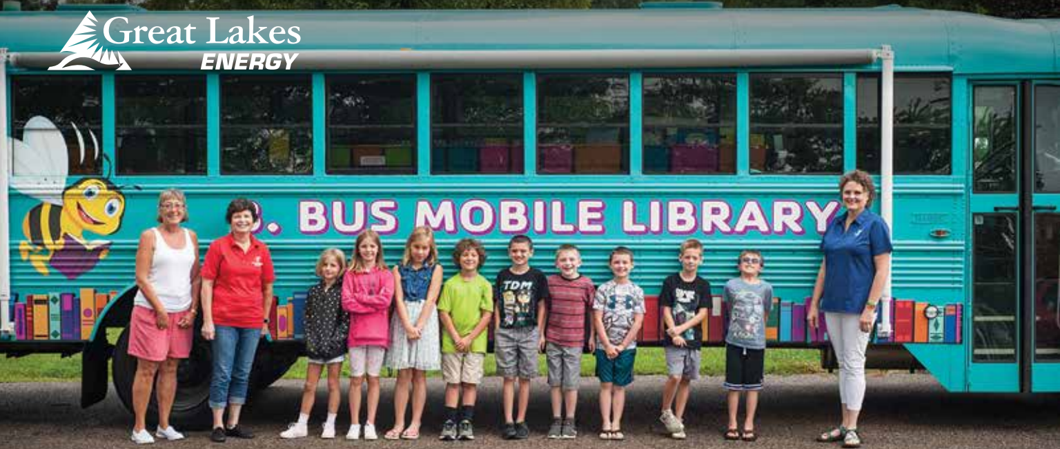
YMCA of Barry County, Hastings