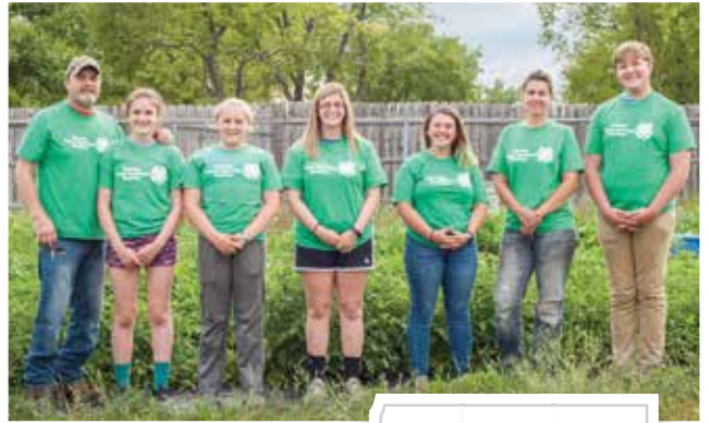
Growing Future Agriculture Business 4-H, Reed City