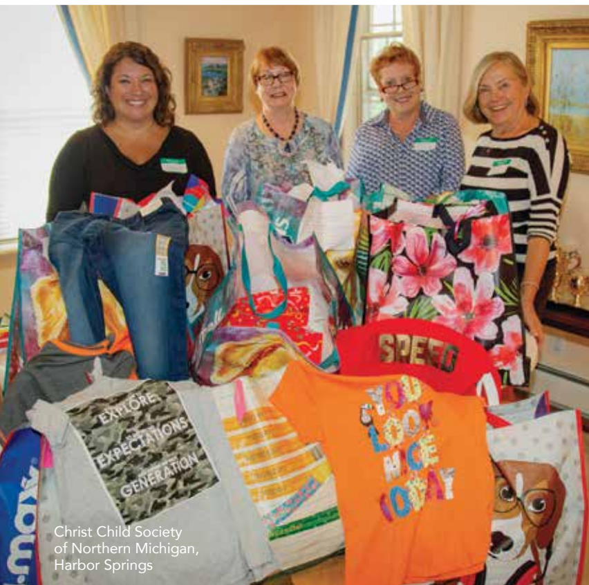
Christ Child Society of Northern Michigan, Harbor Springs