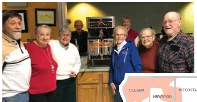
Oceana County Council on Aging, Hart