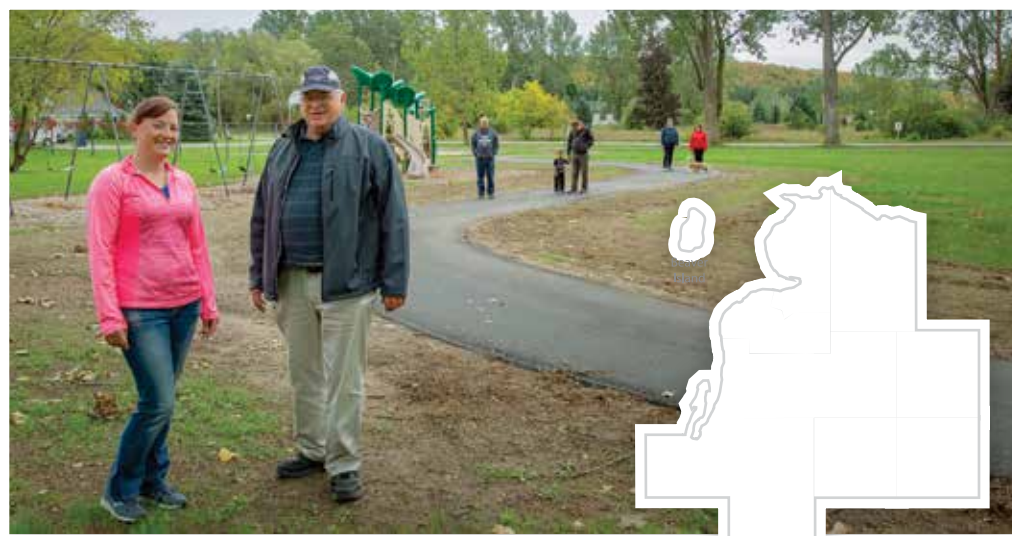
Elmira Township Parks and Rec Committee paved a walkway at a community park.