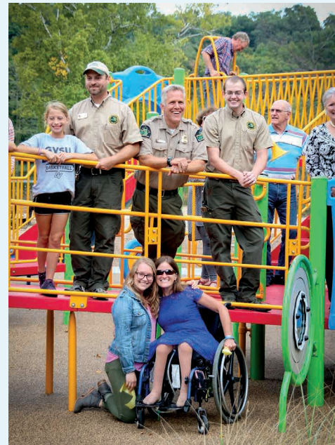
A People Fund grant helped make a popular Ludington playground ADA accessible.

With People Fund PLUS: Bill Amount $65.42 + $.58 for People Fund + $2.00 for PLUS = $68.00