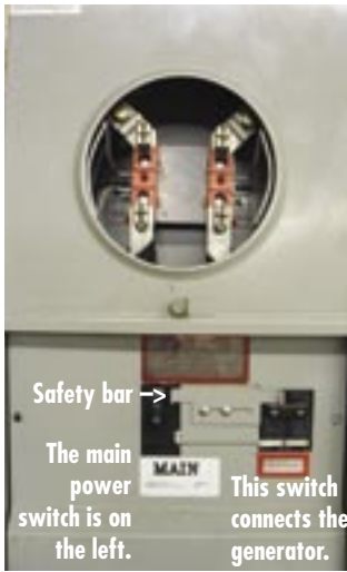
In this photo, the safety bar, which is locking out the generator switch, prevents backfeeding to the power lines.

Your generator might not be large enough to handle the load of all the lights, appliances, TV, etc. at one time. To prevent dangerous overloading, calculate wattage requirements correctly (see chart at far right).