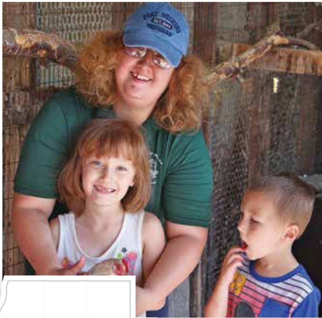
Circle Rocking S Children's Farm in Free Soil made improvements to their buildings.