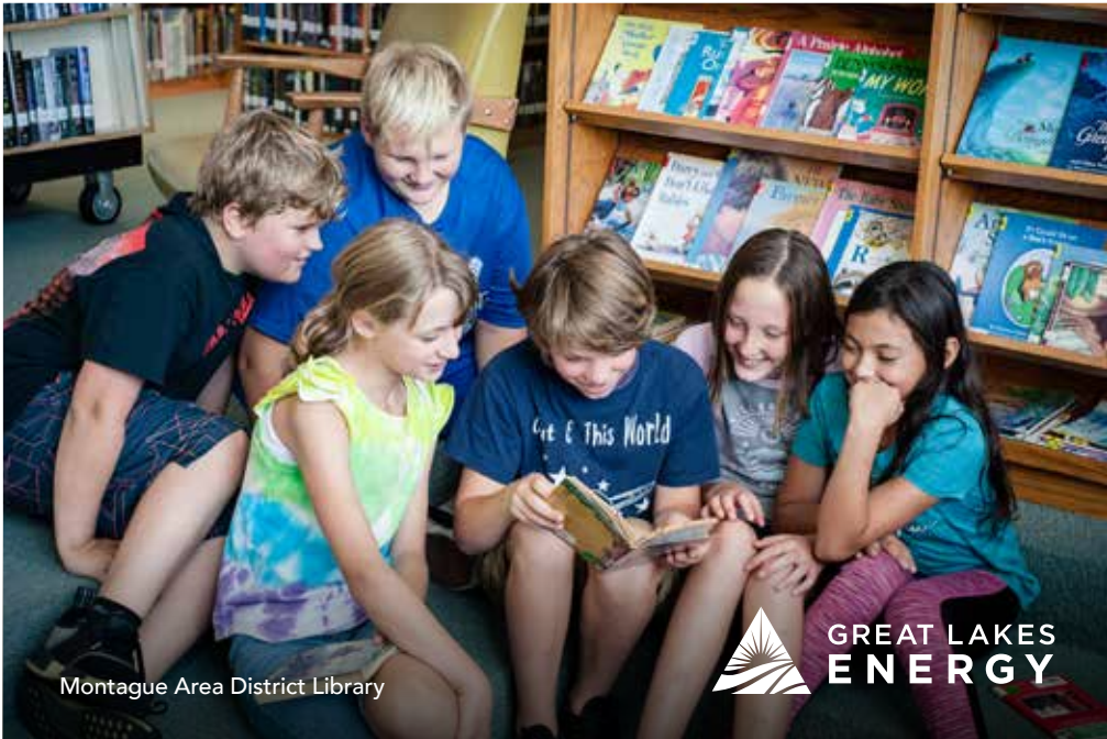
Montague Area District Library