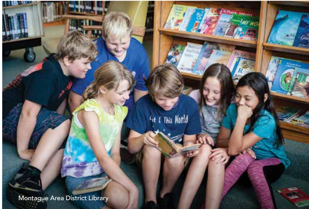
Montague Area District Library