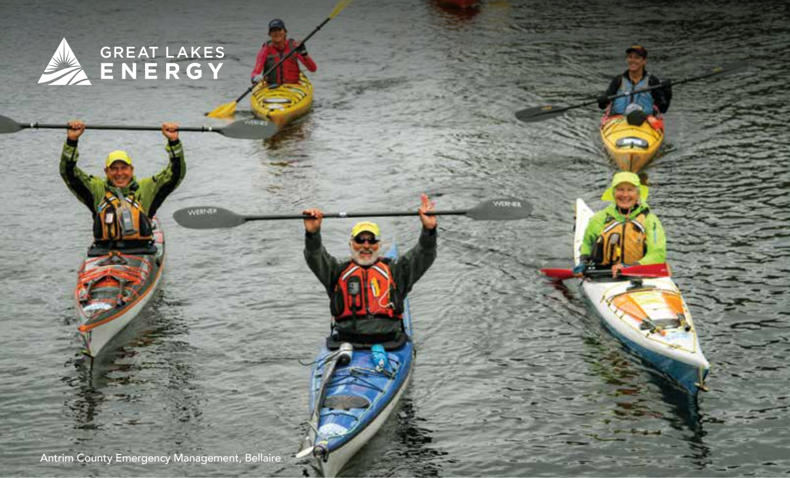
Antrim County Emergency Management, Bellaire