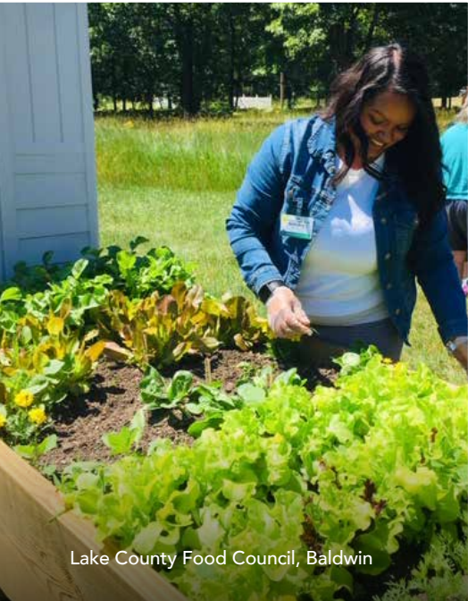
Lake County Food Council, Baldwin