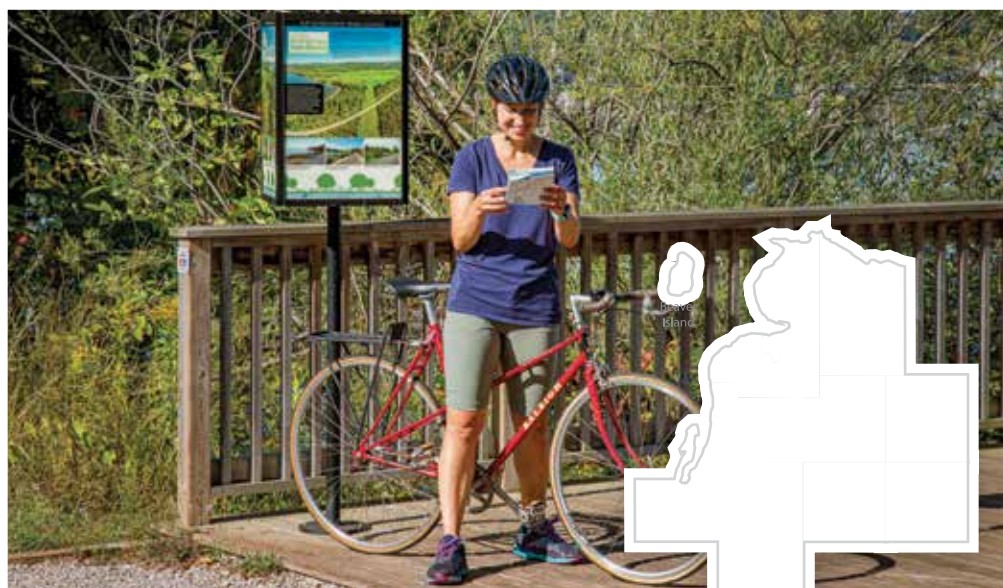
Top of Michigan Trails Council in Petoskey developed trail maps.