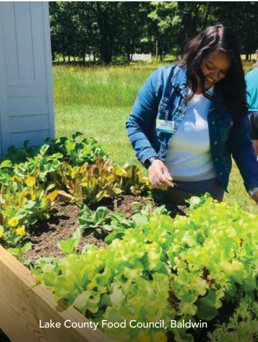
Lake County Food Council, Baldwin