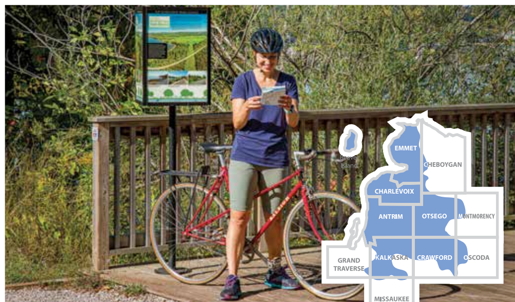
Top of Michigan Trails Council in Petoskey developed trail maps.