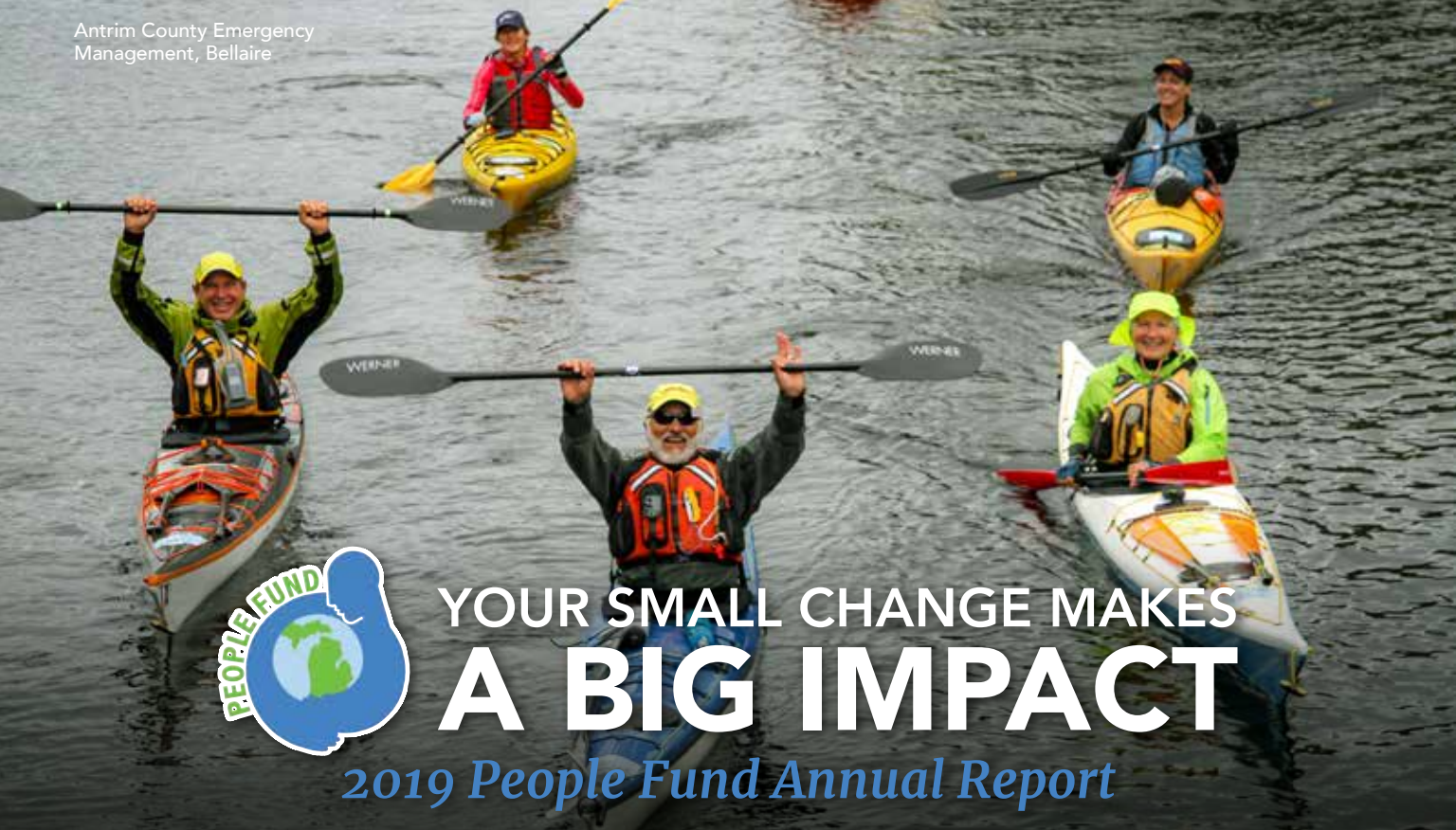
Antrim County Emergency Management, Bellaire