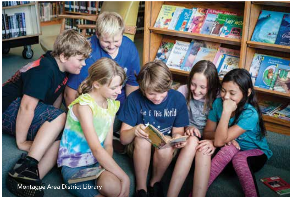
Montague Area District Library