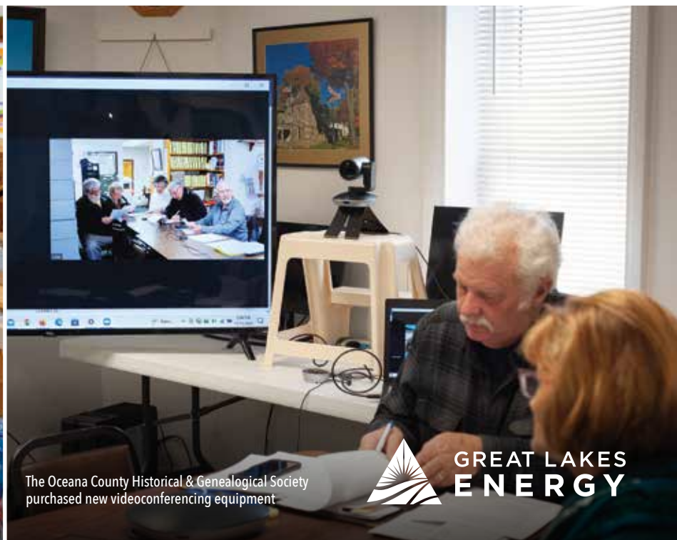
The Oceana County Historical & Genealogical Society purchased new videoconferencing equipment