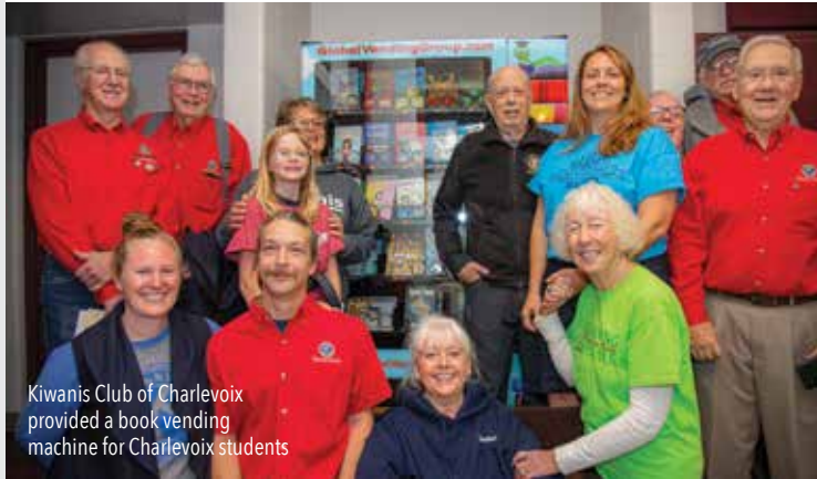
Kiwanis Club of Charlevoix provided a book vending machine for Charlevoix students