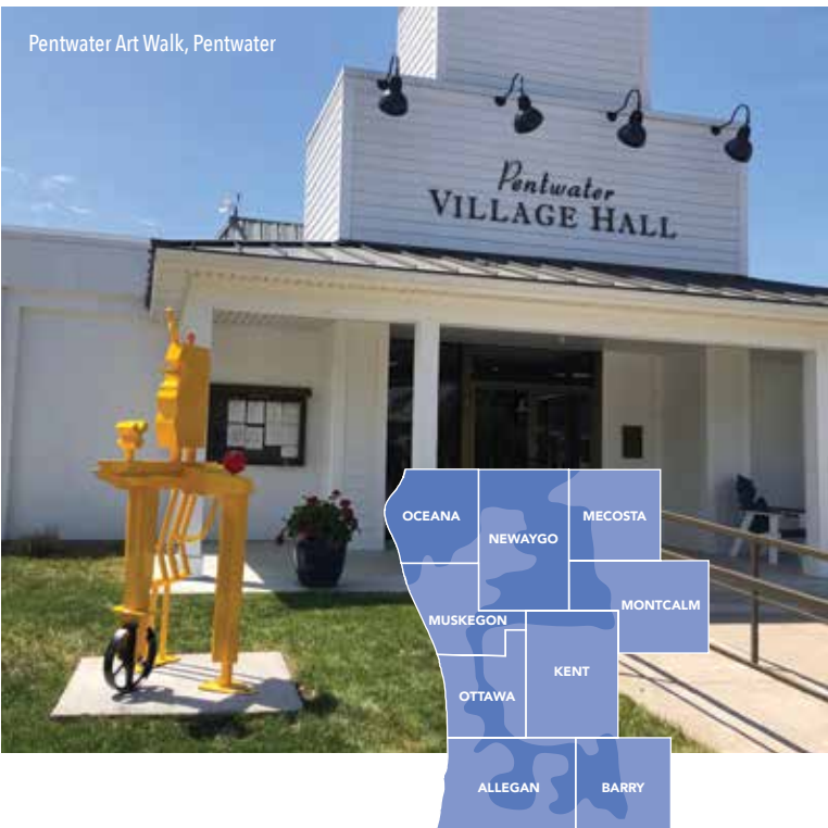
Pentwater Art Walk, Pentwater