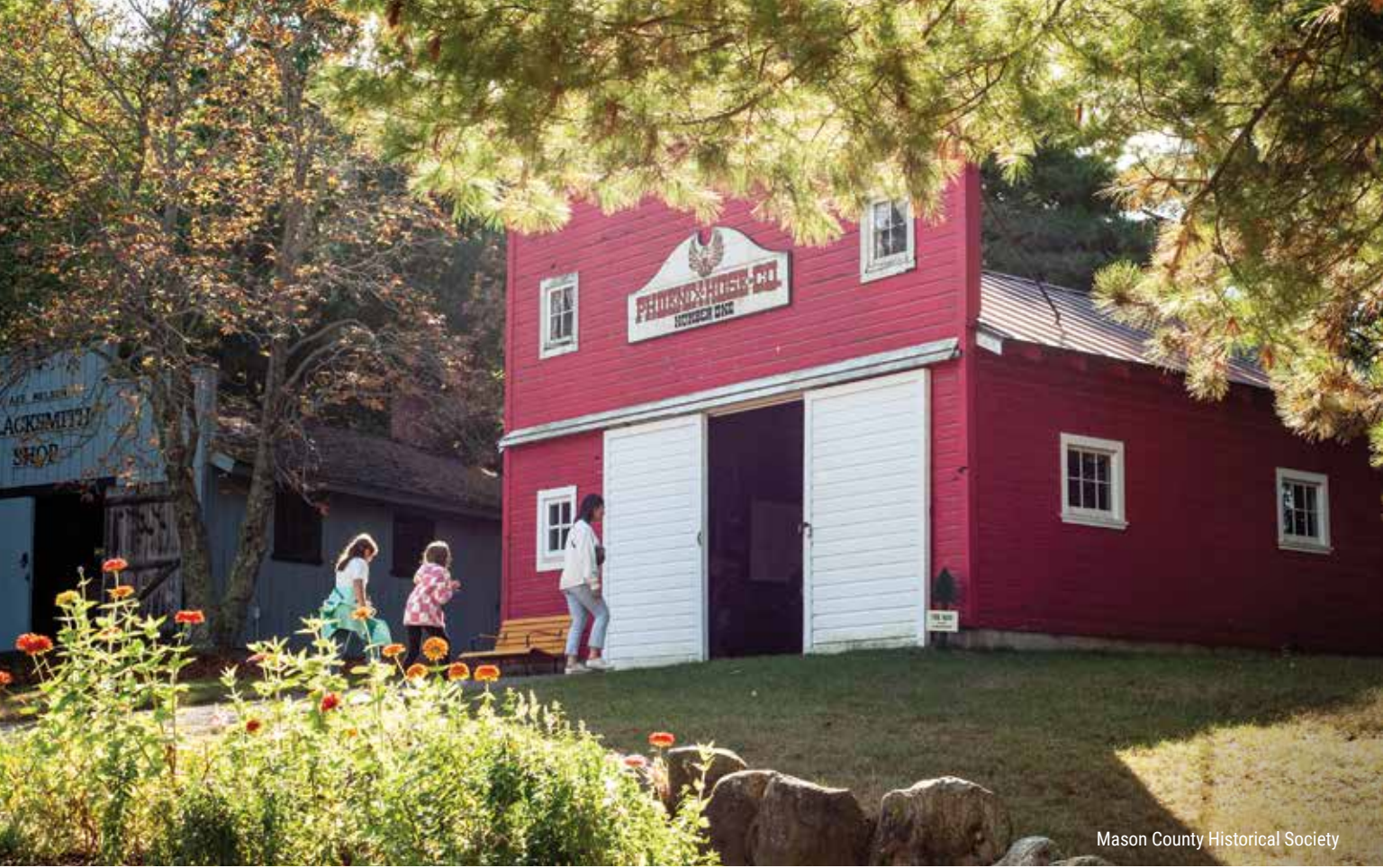
Mason County Historical Society