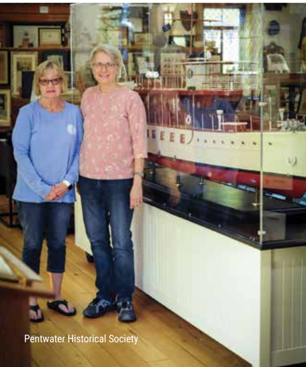
Pentwater Historical Society