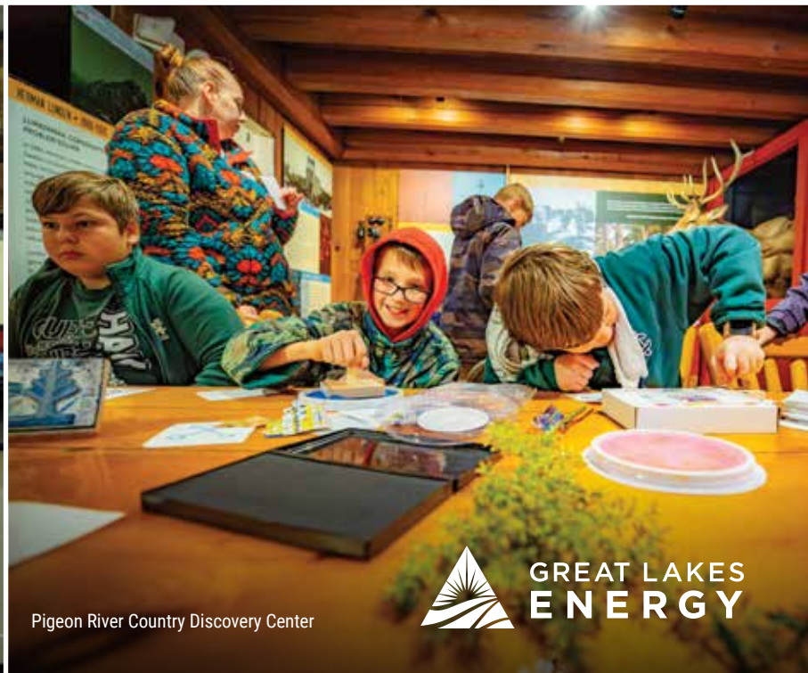
Pigeon River Country Discovery Center